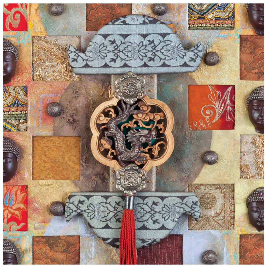
• A late 1800s Chinese wooden dragon carving from a temple screen, with silver medallions and tassel from a late 1800s tibetan festival garment, with tassel wrapped at top with early 1800s calligraphy from a buddhist black manuscript.

(Meaning - The five parts of a sentient being in Pali sanskrit, pronounced, "Kahn-dahs")